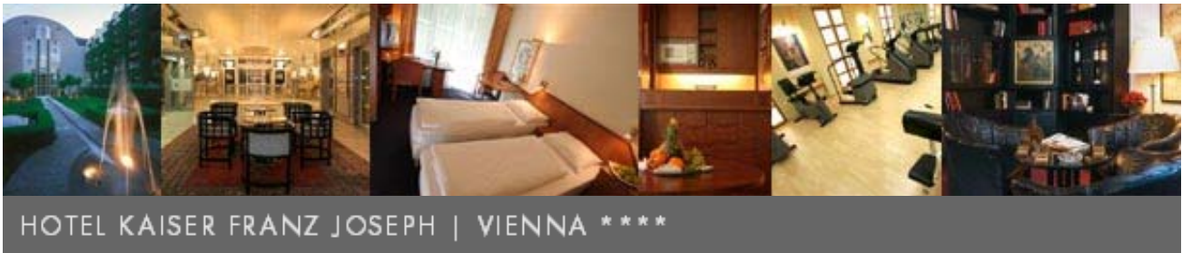
HOTEL KAISER FRANZ JOSEPH | VIENNA * * * *